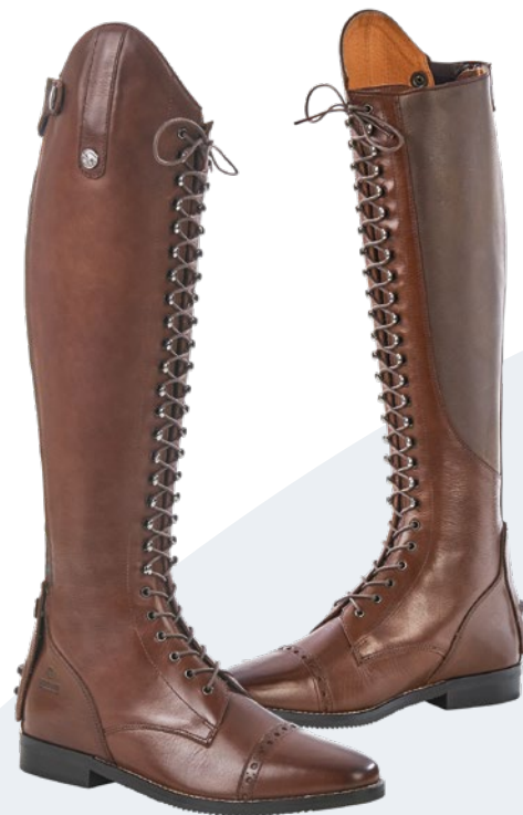
Sizes of Riding Boots LAVAL, brown in cm